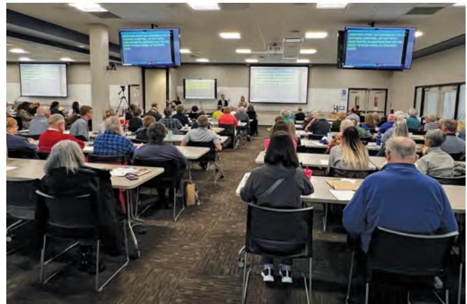
100+ attended the HLAA Wisconsin State Conference