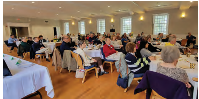
HLAA SE PA Conference attendees