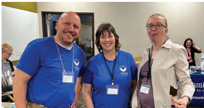
HLAA Wisconsin State Conference exhibitors