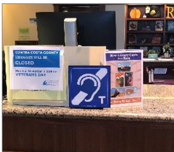
Danville Library, Danville, CA