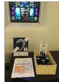
First Congregational Church, Boulder, CO

For example, the photo to the right shows the hearing loop symbol, educational telecoil information, and hearing loop receivers for those who do not have telecoils or hearing devices. In the background is a beautiful, stained window to show the church setting.