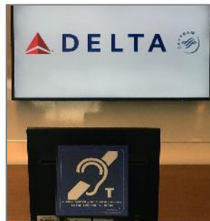
Detroit Metro Airport, Detroit, MI