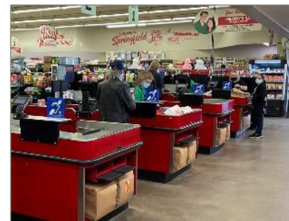
Grocery Outlet, Springfield, OR