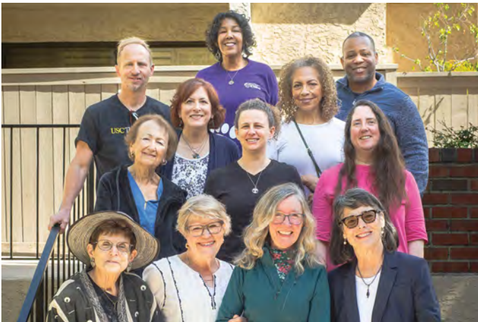
Members of the HLAA Los Angeles Chapter.

Seven HLAA Chapters came together to host 150 attendees at the New England HLAA Conference.