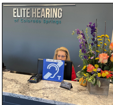
Elite Hearing of Colorado Springs Colorado Springs, CO