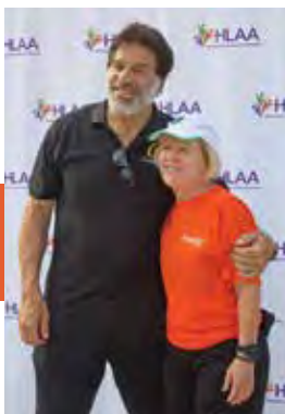
Lou Ferrigno, superhero actor and bodybuilder, connects with walkers in Florida.