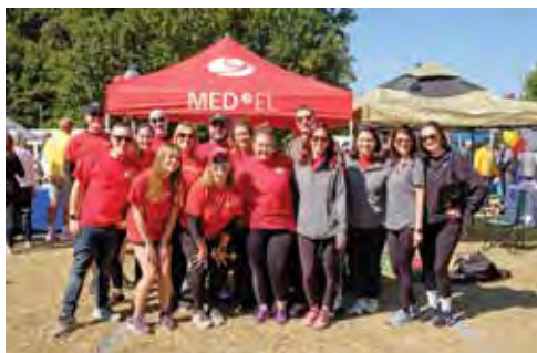
Cochlear at the Florida Walk4Hearing